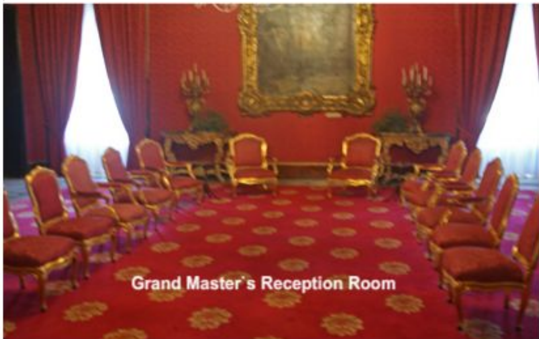
Grand Master's Reception Room

and evacuation from Rhodes, "The Order of St. John" made a "temporary" home in Malta but ruled for 268 years building forts and coastal defences giving great protection and stability to the population, notably withstanding the Great Siege by Turkey in 1565. The Knights were finally ousted by Napoleon in 1798 and after a short period of French rule Admiral Nelson acquired control for Britain from 1800 until Malta became independent in 1964. It is presently a republic and a